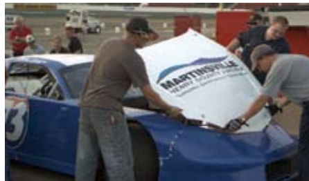
Pictured here is car number 73, sponsored by the Martinsville-Henry County Economic Development Corporation. Students from Patrick Henry Community College participate in all parts of maintaining the car.