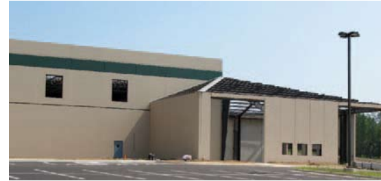
Left: Patriot Centre Industrial Park offers graded sites in a variety of sizes.