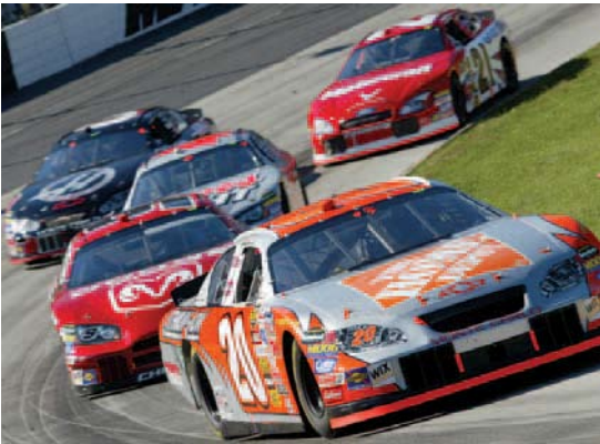
Race day at Martinsville Speedway