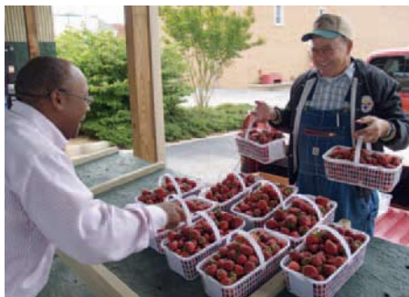
Uptown Martinsville features a Saturday morning farmer's market popular for its organic food and acoustic music.