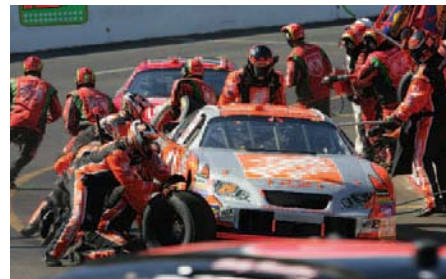
Motorsports companies that located in Martinsville-Henry County have easy access to the Martinsville Speedway to test their cars and components.